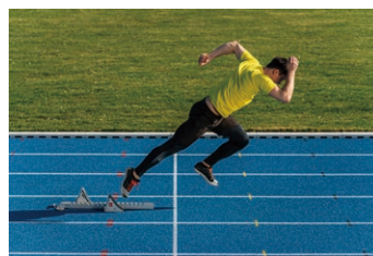
Focal Length: 150mm Exposure: F5.6 1/2000sec ISO: 500