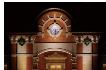
Focal Length: 500mm Exposure: F6.7 1/30sec ISO: 3200

When shooting in the ultra-telephoto range, even the smallest vibrations can lead to loss of image clarity. The 150-500mm F5-6.7 is equipped with VC functionality to support sharp images despite unavoidable camera shake. VC delivers powerful support for handheld shooting of scenes with low light levels, such as at evening and indoor, without the use of a tripod. The lens also features a VC mode selection switch with three modes including a dedicated panning mode, thereby enabling selection of the ideal VC mode to match shooting conditions and preferences.