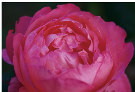
Focal Length: 150mm Exposure: F8 1/100sec ISO: 400

The 150-500mm F/5-6.7 Di III VC VXD (Model A057) features a very compact design, high image quality. This amazing zoom lens achieves a 500mm focal length while retaining a compact size, with a length of just 209.6mm (8.3 in) and a maximum diameter of 93mm, and will be Tamron's first model for Sony E-mount full-frame mirrorless cameras equipped with VC (Vibration Compensation), so it's easy to carry and comfortable to shoot handheld. The design places major emphasis on image quality. The optical construction features 25 elements in 16 groups and utilizes special lens elements and hybrid aspherical lens elements to control chromatic aberrations. BBAR-G2 1 Coating is used to suppress ghosting and flare, which could otherwise occur under backlit conditions. Additionally, the lens has a MOD (Minimum Object Distance) of 0.6m (23.6 in) at the 150mm end, so you can freely enjoy telephoto macro shooting of subjects at closeup distances. The 150-500mm F5-6.7 is a highly versatile lens that lets you capture a wide array of subjects ranging from landscapes and birds to sports and wildlife. You'll be thoroughly amazed when you experience the powerful and unique world of ultra-telephoto lenses for yourself.