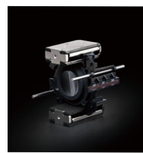
VXD(Voice-coil eXtreme-torque Drive): linear motor focus mechanism

The 150-500mm F5-6.7 zoom's AF drive system is equipped with the VXD 2 linear motor focus mechanism. The VXD mechanism delivers extreme high-speed and high-precision movement and ensures exceptionally responsive performance when photographing subjects such as wild birds, sports, vehicles, and wildlife in general. The linear motor also suppresses drive noise and vibrations during focusing, making it ideal for shooting both still photos and video in environments that demand quietness.