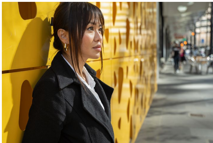
Camera: Sony α7R IV Exposure: F4 1/250sec ISO: 400