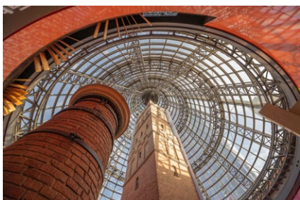
Camera: Sony α7R IV Focal Length: 17mm Exposure: F6.3 1/25sec ISO: 100

The optical construction of the 17-50mm F4 consists of 15 elements in 13 groups. With the precise arrangement of special lens elements, including three LD 3 , one GM 4 and two hybrid aspherical lens elements, chromatic and other aberrations are effectively suppressed. The resolving power across the entire frame with clarity and sharpness, and full use of the rich bokeh delivered by the F4 wide-open aperture get you close to that perfect shot.