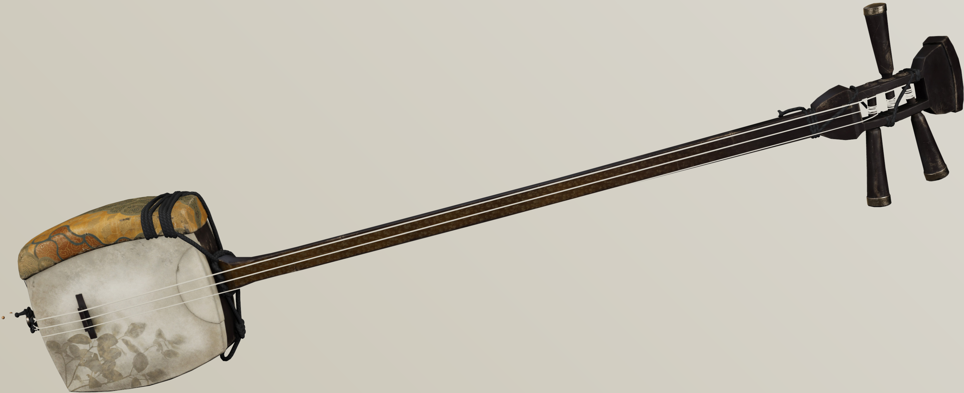
1. MAIN TITLE

The body of the shamisen has the grey silhouettes of growing leaves painted on its bottom right corner, while its side is protected with silk-covered leather that is patterned with cloud-like drawings in red, green, and gold.